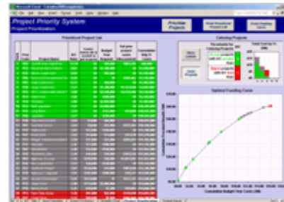
Excel Prioritization Tools